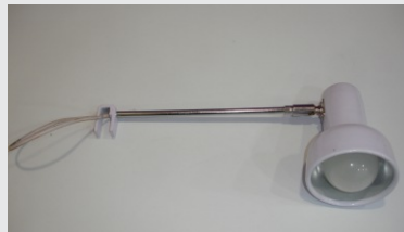
Spot Light (15w LED) 250mm Long Arm