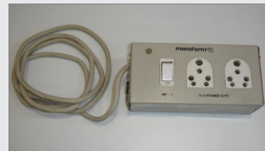
Strip Socket 15 Amp / 5 Amp (Max: 0.75KW)